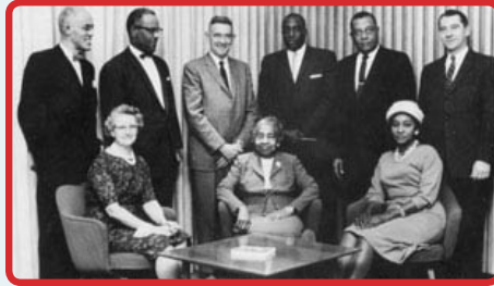
Showing Unity. NEA-ATA Joint Committee members gather at NEA's annual meeting in 1961.

NEA adopts BYLAW 3-1(g) , NEA's most effective and comprehensive measure for encouraging racial/ethnic diversity in leadership at all levels of the organization; ASIAN AND PACIFIC ISLANDER CAUCUS forms at NEA; Collective bargaining legislation passes for higher education employees in Massachusetts.